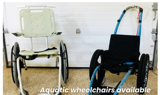
Aquatic wheelchairs available