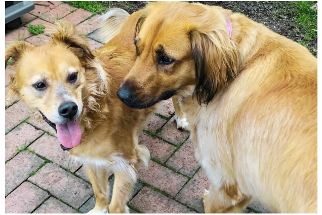
The City of Delano has a two dog (over the age of 6 months) limit per household.